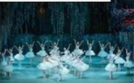
A scene from ballet Swan Lake