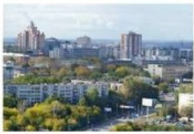
Perm in summer

Perm is the capital city of the Perm Krai. It is a major administrative, industrial, scientific, and cultural center of the Perm Krai. Perm is located on the banks of the Kama River in the European part of Russia, near the Ural Mountains. The Kama is the main tributary of the Volga River and one of the deepest and most picturesque rivers in Russia. The Kama divides the city into two parts: the central and the right bank. The city stretches for 70 kilometers (43 mi) along the Kama river