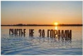
Monument on the embankment of the Kama river