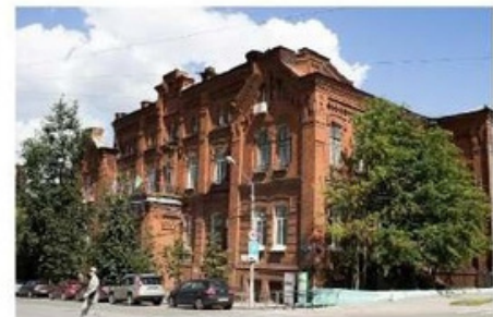
The main building of the Perm State Agro-Technological University

There are several Universities located in Perm, including the Perm State Agro-Technological University.