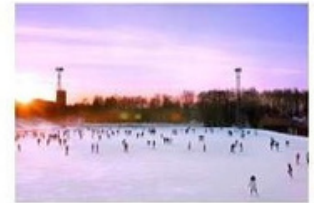
Ice-skating at the Palace of Sport "Orlyonok"

There are several Universities located in Perm, including the Perm State Agro-Technological University.