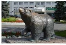
The Perm sculpture of a bear