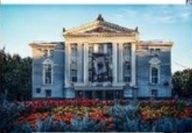
The Opera and Ballet Theatre