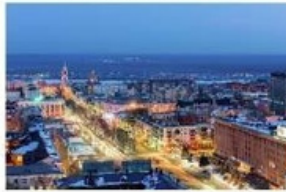
Perm in winter

There are many theatres in Perm. Perm is proud of its Opera and Ballet Theatre. The ballet troupe is one of the most popular and prestigious in Russia. Additionally, there are the Perm Academic Theatre, the Puppet Theatre, the Theatre for Young Spectators, the Near Bridge Theatre.