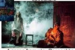
A scene from play Pannochka of the Theatre Near Bridge