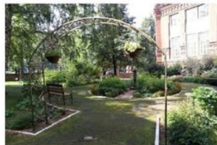
The Mariinsky Garden, located near the University