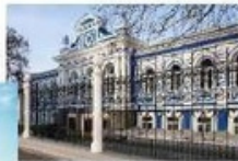
Theatre for Young Spectators